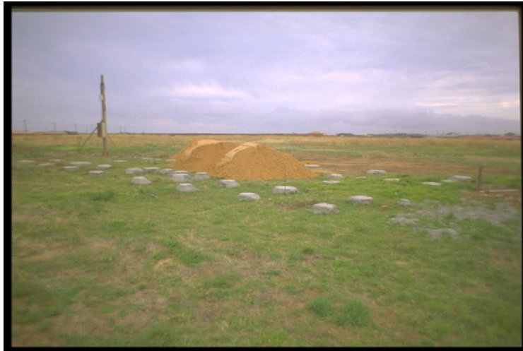
CONCRETE CAPPED STEEL PILES 6000 MM LONG INTO HARD CLAY